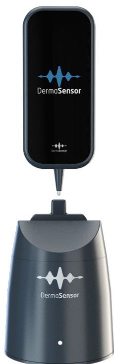
Figure 1. Handheld ESS Device

A total of 1,005 patients with 1,579 lesions suggestive of skin cancer were enrolled. Among the patients enrolled, 51.4% were female with a mean age of 59 years, and 72.5% of patients were Fitzpatrick Skin Type I-III. (Table 1)